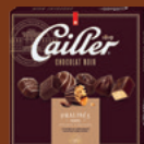
Dark chocolate 207g