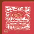
Ambassador Swiss Art 231g